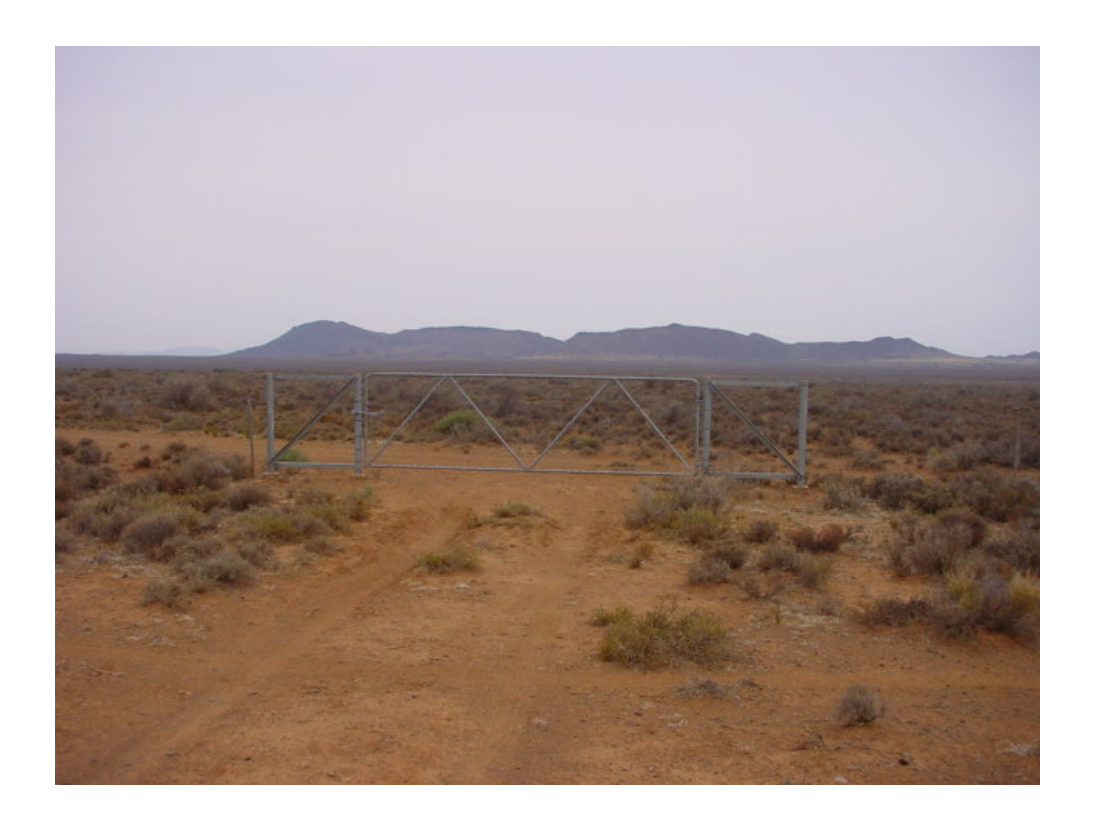
Figure 3: Standard Eskom gate as was used on the Hydra- Droërivier No 3 Line.

This gate is installed during the construction of a new line.