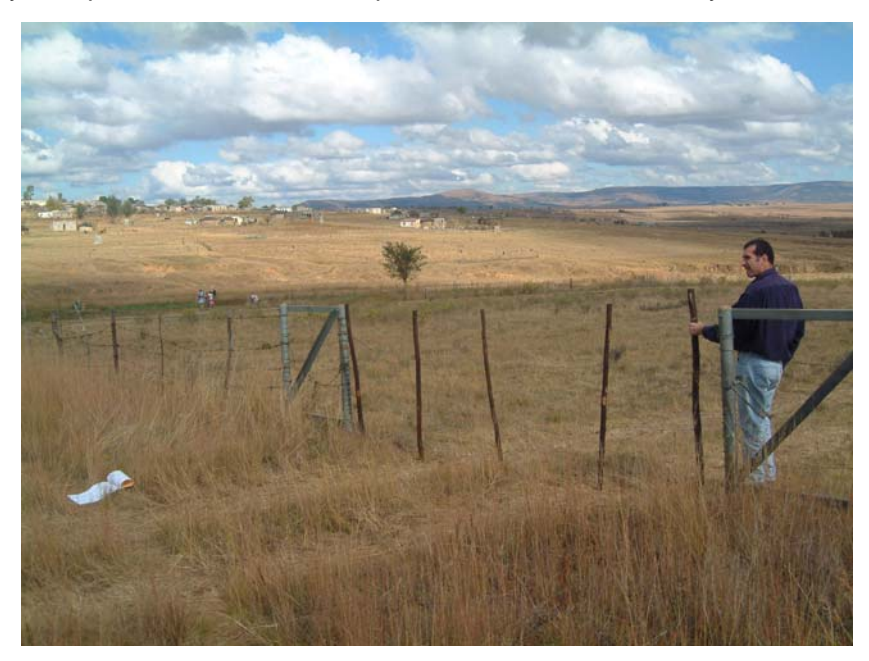
Figure 5: An example of a "concertina gate" that is being used as a servitude gate. Also note quality of fencing used adjacent to the gate.

In areas where the theft of gates is particularly prevalent, use can be made of concertina gates. These gates are very cheap to manufacture and experience has shown that they are not affected by theft.