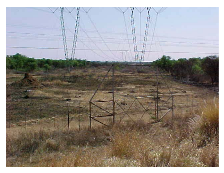
Figure 4 A game fence as used on the Matimba-Spitskop 1&2 lines. Note that the top section has been omitted as per the latest 5m game gate design.

Where game farming is practised, gates that are appropriate for game shall be installed.